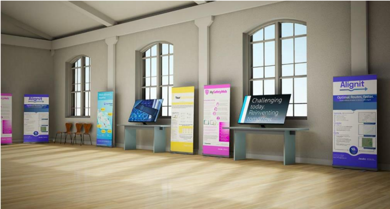
Plate 8.1 Example of virtual exhibition space