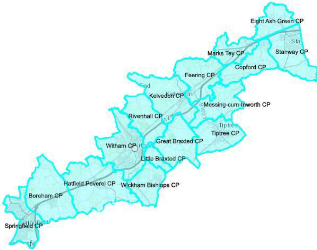
Plate 6.1 Mailout zone